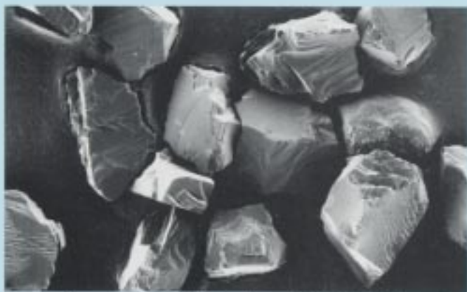
Sharp edges of monocrystalline diamonds in METADI Diamond Suspensions ensure clean and efficient cutting action. Particle size 45 micron. SEM - 450x.