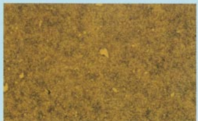
Tool steel prepared with METADI SUPREME Diamond Suspension. 2% nital etch, brightfield - 400x.