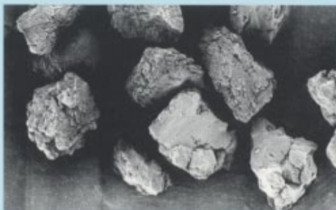
Spherical shaped polycrystalline diamonds of METADI SUPREME provide numerous cutting facets on the particle surface. Particle size 45 micron. SEM - 450x.