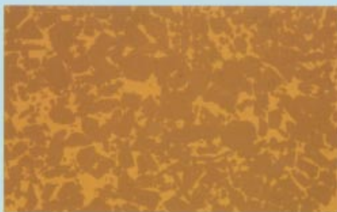
Silicon nitride prepared with METADI Diamond Suspension. As polished, DIC - 400x.