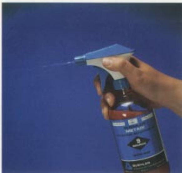
METADI Diamond Suspensions can be manually dispensed using the pump spray nozzle included with each bottle.