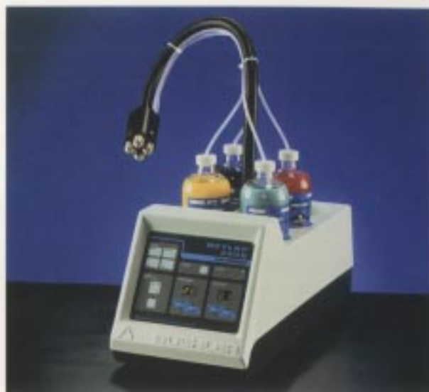
The METLAP 2000 Fluid Dispenser provides automatic dispensing capabilities for both the METADI and METADI SUPREME Diamond Suspensions.