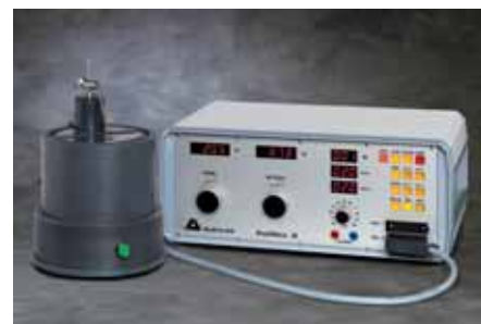
The PoliMat 2 consists of two components, the controller and power supply unit and the electrolytic cell. The controller is built into a robust metal housing. Preparation parameters can be adjusted separately.

Most metallic material, with the exception of stainless steel, can be etched after the polishing process with the same electrolyte.