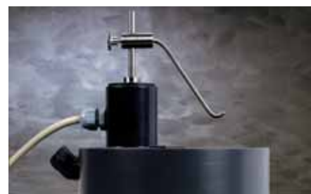
The tank mount serves as a platform for the specimen. Easily exchangeable masks allow the preparation of differently sized specimen-areas.