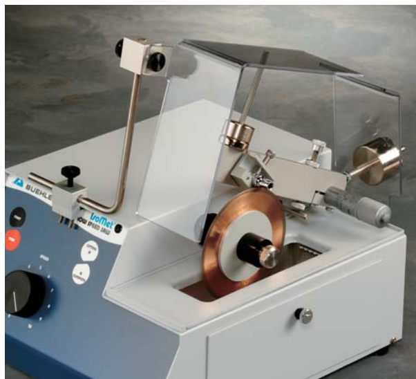
The optional Splash Guard Kit (No. 11-1199) prevents coolant from spraying.