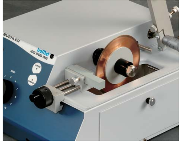
The optional dressing chuck (No. 11-1196) allows dressing of the wafering blade without interrupting the sectioning process.