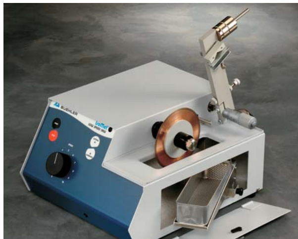
Sectioned samples are easily retrieved through the side coolant tray door and basket.