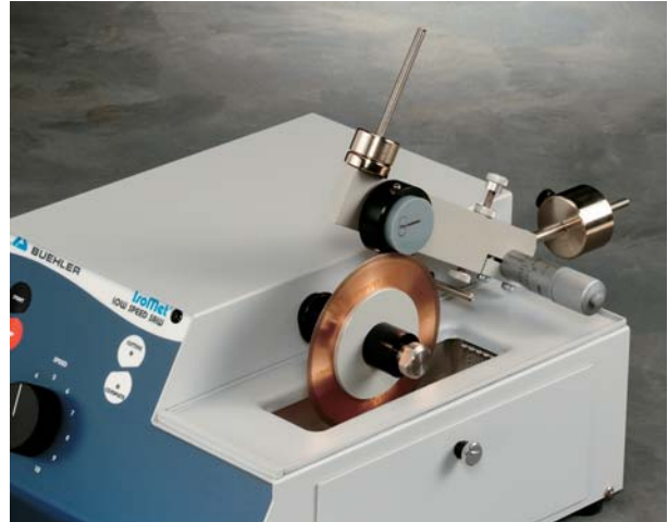
Mounted samples can be sectioned effectively with proper selection of chucks and flanges.