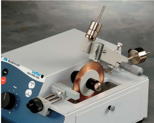
Accurate sectioning is possible with the use of application specific diamond wafering blades and a precision micrometer.